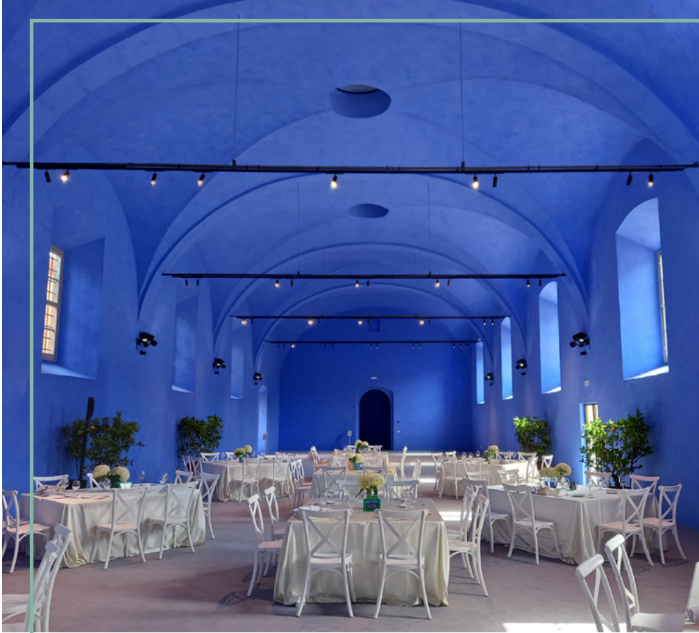
Lemon Houses The Blue Room The Stables